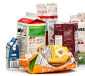
Dairy & Juice Cartons