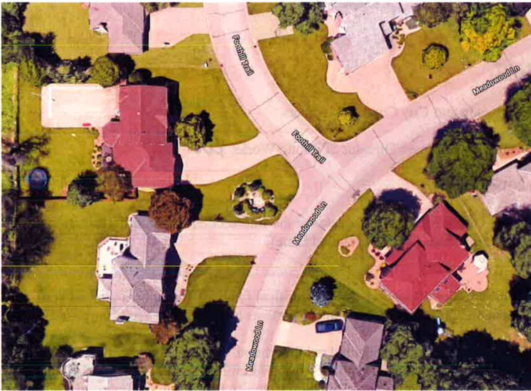
The lift station is located in the center of this photo, just to the left of the intersection of Foothill Trail and Meadowood Lane.