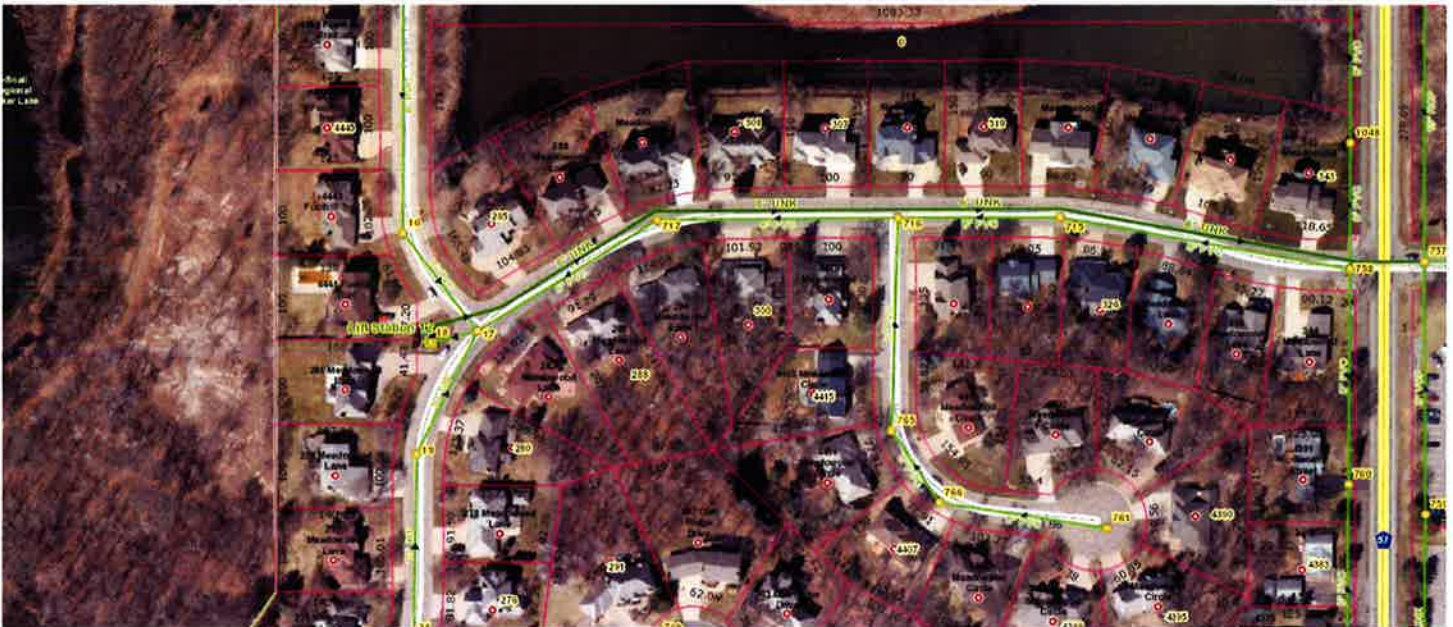
The lift station receives sewage from approximately 300 homes and pumps it via forcemain (+20' vertical, and 1,100' east to sewer in McMenemy Road).